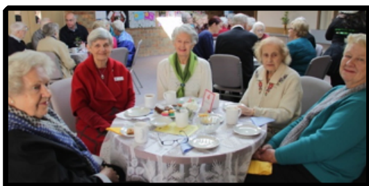
Special morning tea

Our two special morning teas this year have both been very successful. Staff from The Body Shop at The Glen worked with us in these community events as we raised money for The Royal Children's Hospital Good Friday Appeal and the Cancer Council