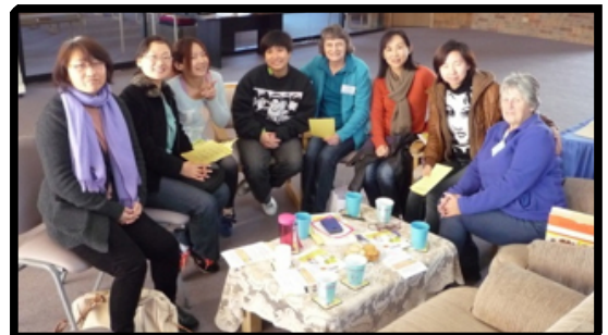
Discussion at The Hub

At The Hub we continue to meet people from the community, and our relationships with these people are growing. As we get to know them better, we are becoming more aware of their needs. People come to The Hub looking for company, friendship, support and a community to belong to. We have the opportunity of being that community for these people.