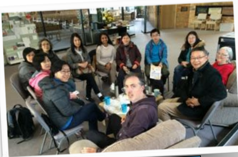
Chatting at The Hub

during their busy day. Whatever the reason is for visitors to come to The Hub, they are all very welcome.