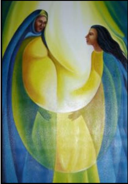
Mary visits Elizabeth

This Gospel is not an eyewitness account but used the Gospels of Matthew, Mark, a source known as Q and other written and oral sources. Often called 'The Gospel of Women' due to the many women stories such as those about Mary and Elizabeth, some have proposed that the writer had access to a source, or collection of teachings perhaps written by women.